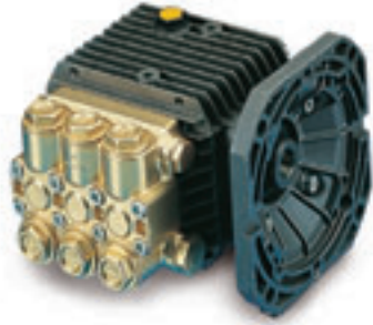
Hollow Shaft Direct Drive – Flanged for direct couple to electric motors