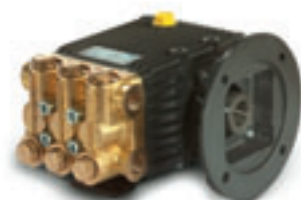
WJH-F & WJH

WJH-F SERIES: Triplex Plunger Pump with Bronze Connecting Rods 3450 RPM Direct Drive with 5/8" Hollow Shaft and NEMA 56C Flange, 3/8" inlet x 3/8" outlet, 13.2 lbs. Compare to: General Pumps – the TT series and AR Pumps – XTV series.