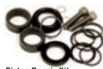
Piston Repair Kit