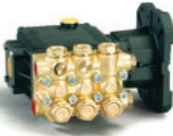
EZ Series Hollow Shaft Direct Drive – flanged for direct couple to gasoline engines