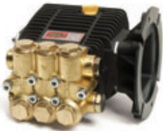
WMH & WMH-F

WMH SERIES: Premium Triplex Plunger Pump with AI Connecting Rods 1725 RPM Direct Drive with 5/8" or 3/4" Hollow Shaft and NEMA 56C Flange, 1/2" inlet x 3/8" outlet, 14.7 lbs. Compare to: AR Pumps – XMV series.